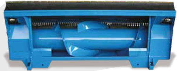
SPIRAL AUGER PADDLES