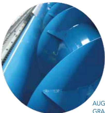
AUGER & GRAIN PAN

Spring stainless steel flange tipped fingers give increased wear resistance as well as providing a more aggressive stripping action. The fingers are orientated with the cups facing upwards to aid in stripping hard threshing varieties. These cups also contain the grain and control its trajectory as it moves through the header.