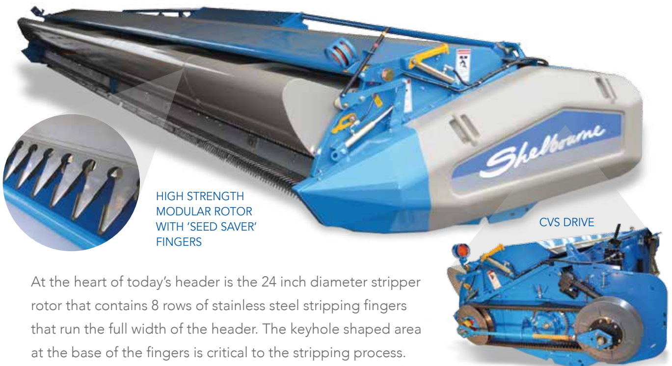
HIGH STRENGTH MODULAR ROTOR WITH 'SEED SAVER' FINGERS

The Shelbourne Header has been developed to reduce the amount of straw being taken into the combine and significantly increase its capacity.