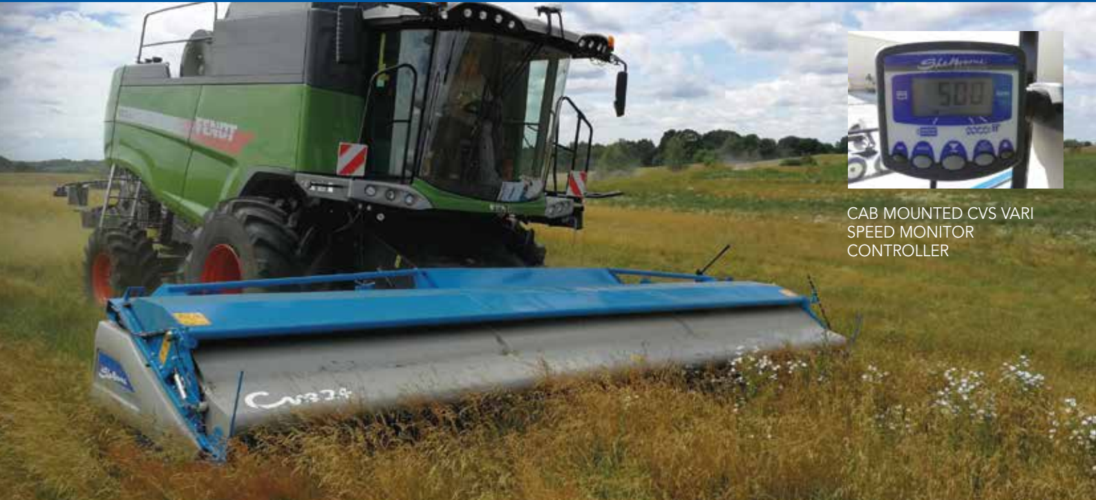
CAB MOUNTED CVS VARI SPEED MONITOR CONTROLLER

SHELBOURNE REYNOLDS HAS RECOGNISED THAT THE LIMITING FACTOR IN COMBINE PERFORMANCE IS THE ABILITY OF THE MACHINE TO HANDLE LARGE AMOUNTS OF STRAW AND SEPARATE GRAIN FROM IT.